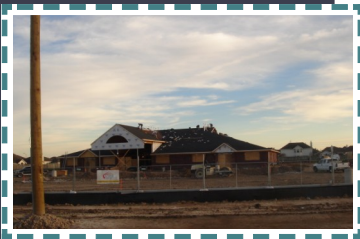
Kids R Kids Project in Richmond, Texas