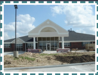
Kids R Kids Project in Richmond, Texas