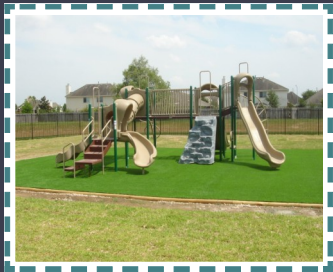
Kids R Kids Project in Richmond, Texas